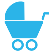
Child Care (Along with the Care Provider's Tax ID Number and Address)