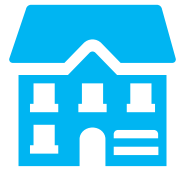
Taxes Paid (Such as Vehicle Taxes and Real Estate Taxes)