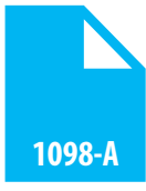
Health Insurance Purchased Through the Marketplace