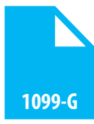
Unemployment, State and Local Tax Refunds