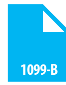
Stock Transactions – Brokerage Statements