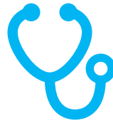
Qualifying Medical and Dental Expenses